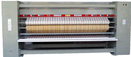
Model 3600 Ironer