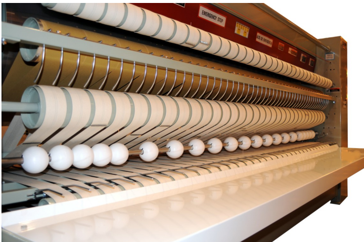
Front View of the OSB Smooth Fold System

The OSB provides a crisp and smooth primary fold. The OSB system keeps the linen tight as the IFC or IFCS makes the primary folds.